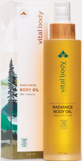
RADIANCE BODY OIL CBD & ROSEHIP 5 oz • 750 mg CBD

Discover optimum vitality and awaken your senses with daily self-care rituals.