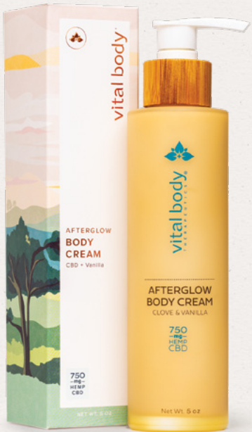
AFTERGLOW BODY CREAM CBD & VANILLA 5 oz • 750 mg CBD

INGREDIENTS: SUNFLOWER OIL, SAFFLOWER OIL, APRICOT KERNEL OIL, ROSEHIP OIL, ORGANIC BROAD-SPECTRUM HEMP EXTRACT, ARNICA, CALENDULA, CHAMOMILE, COMFREY, DANDELION, GINGER, TOCOPHEROL, AND ESSENTIAL OILS OF LAVENDER, JUNIPER BERRY, ORANGE, CEDARWOOD, AND VETIVER.